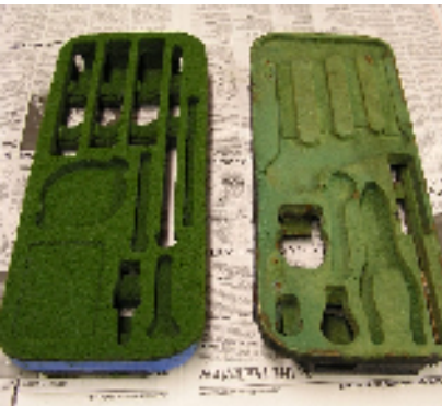
Re-flocked tray and original tray