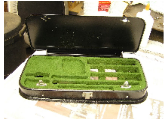
Restored tool tray